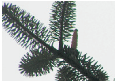
Abies delavayi subsp. fansipanensis with rachis of disintegrated cone at 2860m altitude.