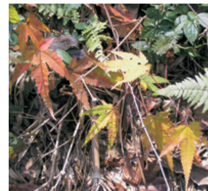
Normally deciduous maple seedlings retaining their leaves through winter.