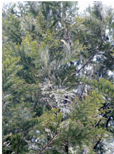
A small tree of the once common Fokienia hodginsii now increasingly hard to find.