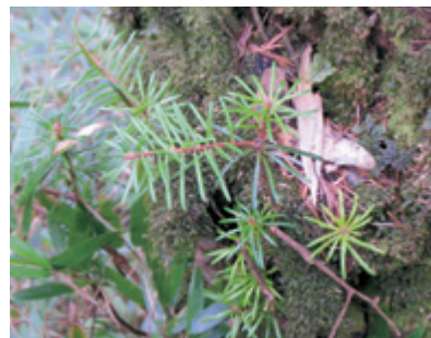
One of the few fir seedlings surviving bamboo competition above the leaf litter.