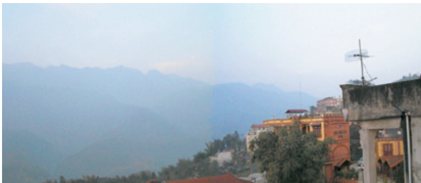
Hoang Lien Range and Mount Fansipan with Sapa in foreground.