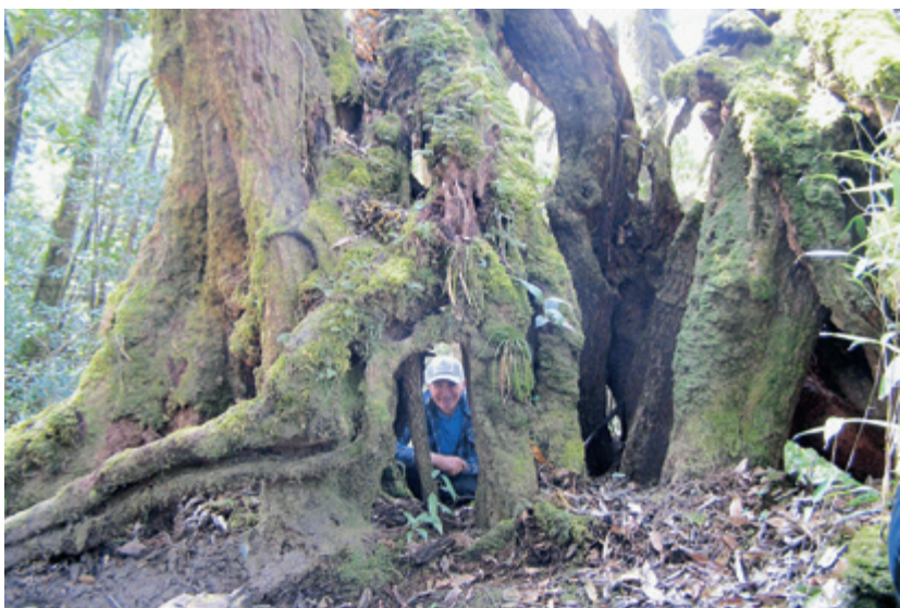
Tree trunk hollowed by long-past fire.

at a brisk pace and therefore had little time to check the identity of the forest trees we were passing through, observing instead the smaller plants such as an evergreen blackberry ( Rubus lineatus ), a Rhododendron species and seedlings of Acer flabellatum , the parent tree obscured by the forest.