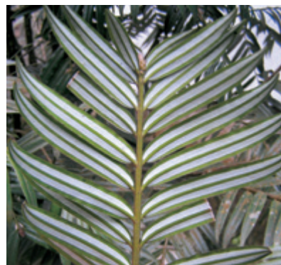
The silvery undersides of an Amentotaxus species leaves.