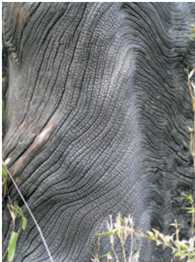
Beautiful tracery on a burnt tree-trunk.