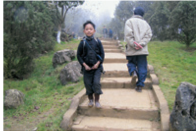
A local young vendor in the Sapa Botanical Garden.