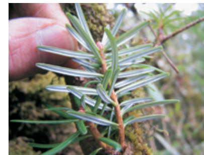
Abies delavayi subsp. fansipanensis leaves showing recurved margins.