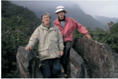
SK and Kha, our ethnic minority guide, on a ridge overlooking Fansipan's eastern flanks.