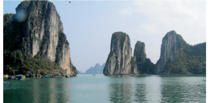
Breathtaking World-heritage listed Halong Bay, east of Hanoi.

Amentotaxus sp. with remarkably broad silver stomatal bands on the reverse of the leaves. Although not seen by us, Amentotaxus argotaenia , the catkin yew, is listed as occurring in the Hoang Lien National Park, as is A. yunnanensis . However the plant seen in the Botanical Garden has broader leaves than mentioned for both species (Rushforth, 1987).