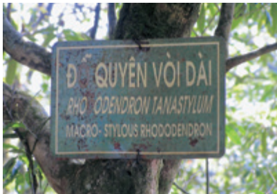
One of numerous tree identification signs in an area of the forest.